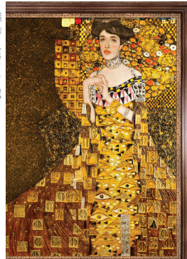
The Woman in Gold