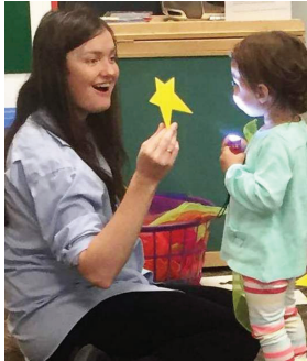
Fun Events for Kids

Reading and Writing with Anne Frank Travelling Museum Exhibits