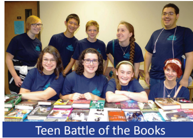
Teen Battle of the Books